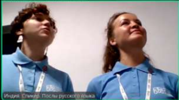
Индия. Спикер. Послы русского языка