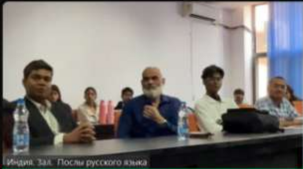
Индия. Зал. Послы русского языка